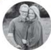
Mary Beth & Steven Curtis Chapman